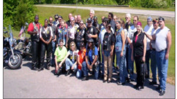
CMA Blessed Riders, Newnan, GA Run for the Son ** May 6, 2007

(Printed with permission from www.cmausa.org )